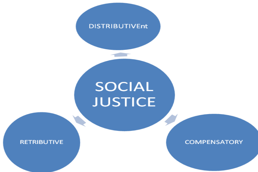
Figure 2: Basic Social Justice

convict for his/her criminal activities. An assortment of different man made (General) systems of Social Justice have been present here under.